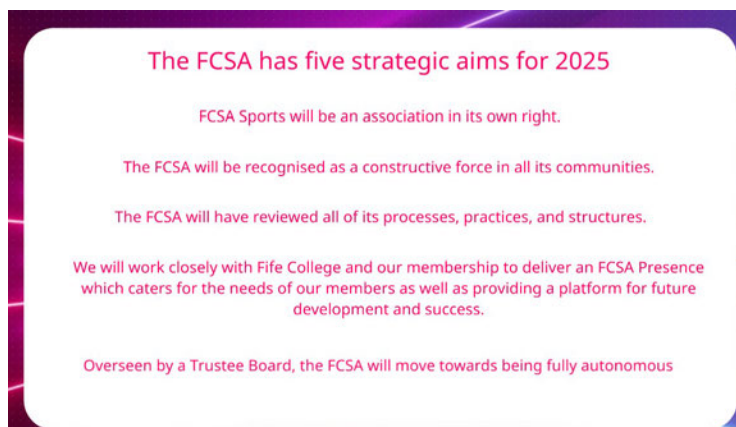
Image 2 shows the FCSA 2025 Strategic Aims