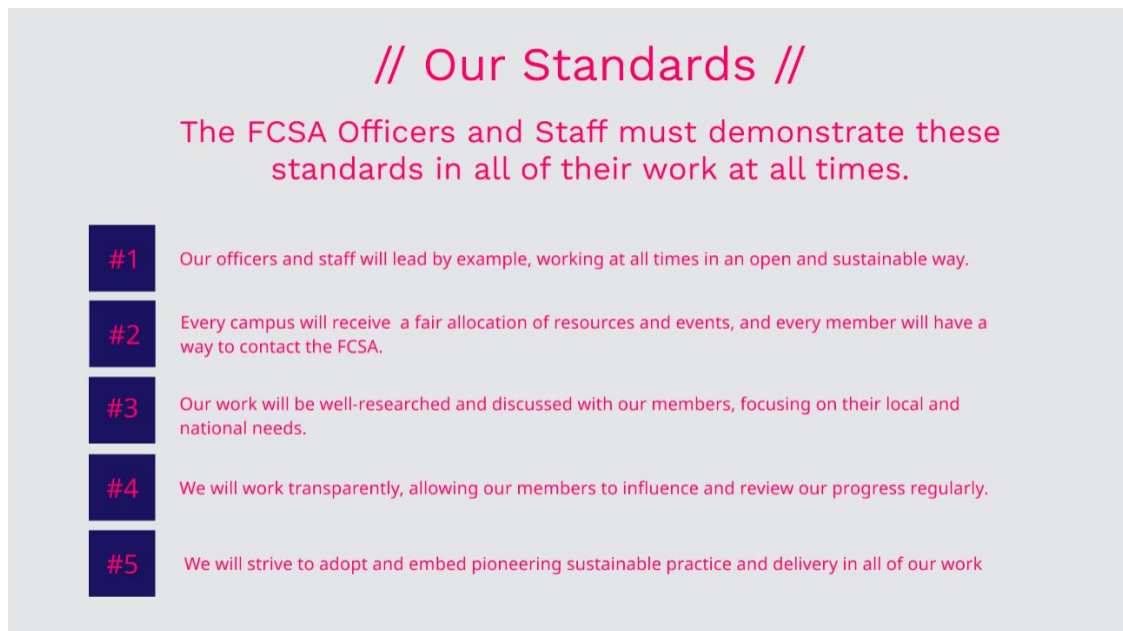
Image 1 shows the FCSA Standards